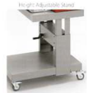
Height Adjustable Stand