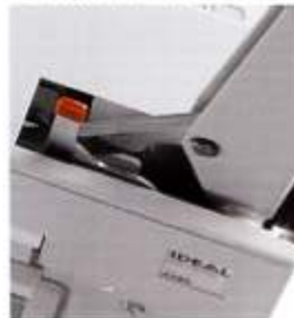
Safety Catch (manual models)