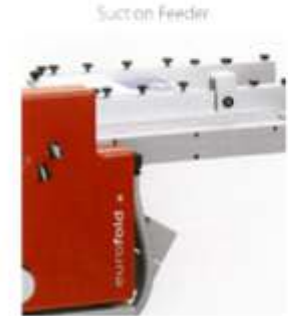
Suct on Feeder