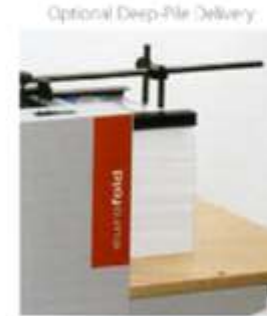
Optional Deep-Pile Delivery