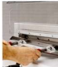
Blade change without cover removal