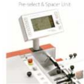
Pre-select & Spacer Unit