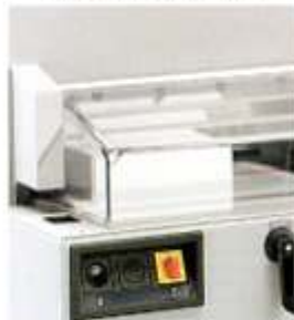
Transparent Safety Guards