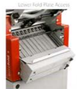
Lower Fold Plate Access