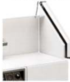
Infra-red Safety Curtains