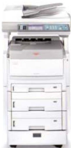
ES8460 MFP (CDXN)