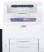
ES7120 / ES7130