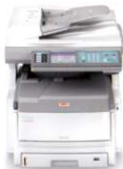
ES8460 MFP (DN)