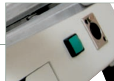
Step-by-step reverse button.