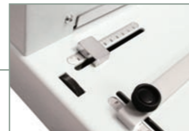
All steel robust side lay with micro adjust feature for accurate punching.