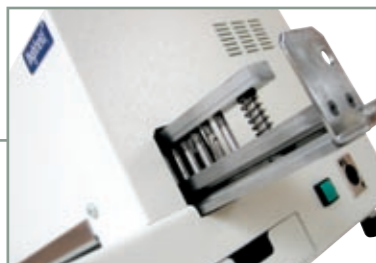
Quick & easy tool change with over 20 dies available.