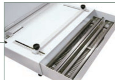
Large storage drawer for spare dies.