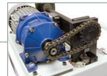
Industrial gearbox with chain drive for optimum power.