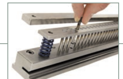
Robust, high quality design with solid steel quality engineered dies, with individual isolating pins for easy size adjustment.